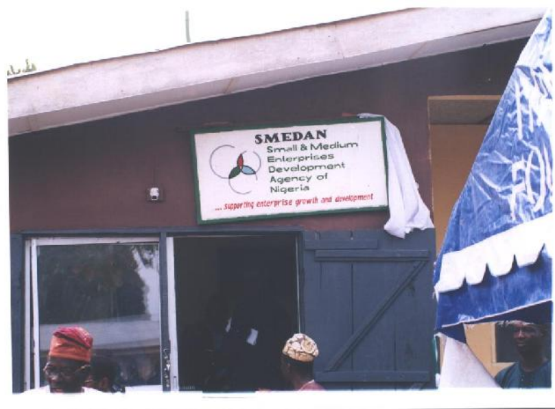
BIC Ibogun, Ogun State

The Agency established two Business Information Centres [BICs] in 2005. One was established in partnership with the Computer and Allied Products Dealers Association of Nigeria [CAPDAN] at 21 Kodesoh Street, Ikeja, within the ICT Cluster popularly known as Computer Village in Lagos State. The purpose was to upgrade the status of the cluster and fast-track the growth of ICT industry in Nigeria. Another Center was established in Ibogun-Olaogun, in Ogun State to facilitate the growth of agro-processing industry in the rural community.